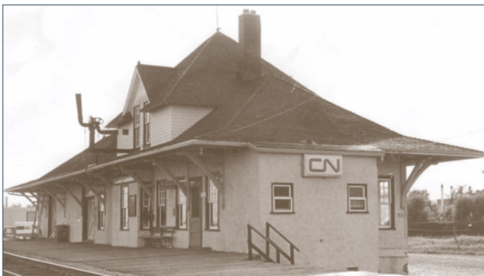
Fort Saskatchewan CNoR depot, 3rd Class Plan, July 1973.

TRACTIVE POWER CORPORATION www.tractivepowercorp.com