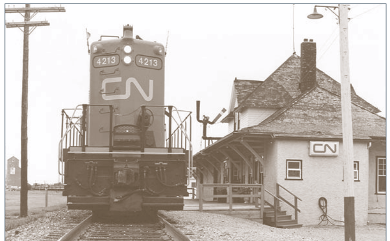
Right: Fort Saskatchewan depot, 1985.